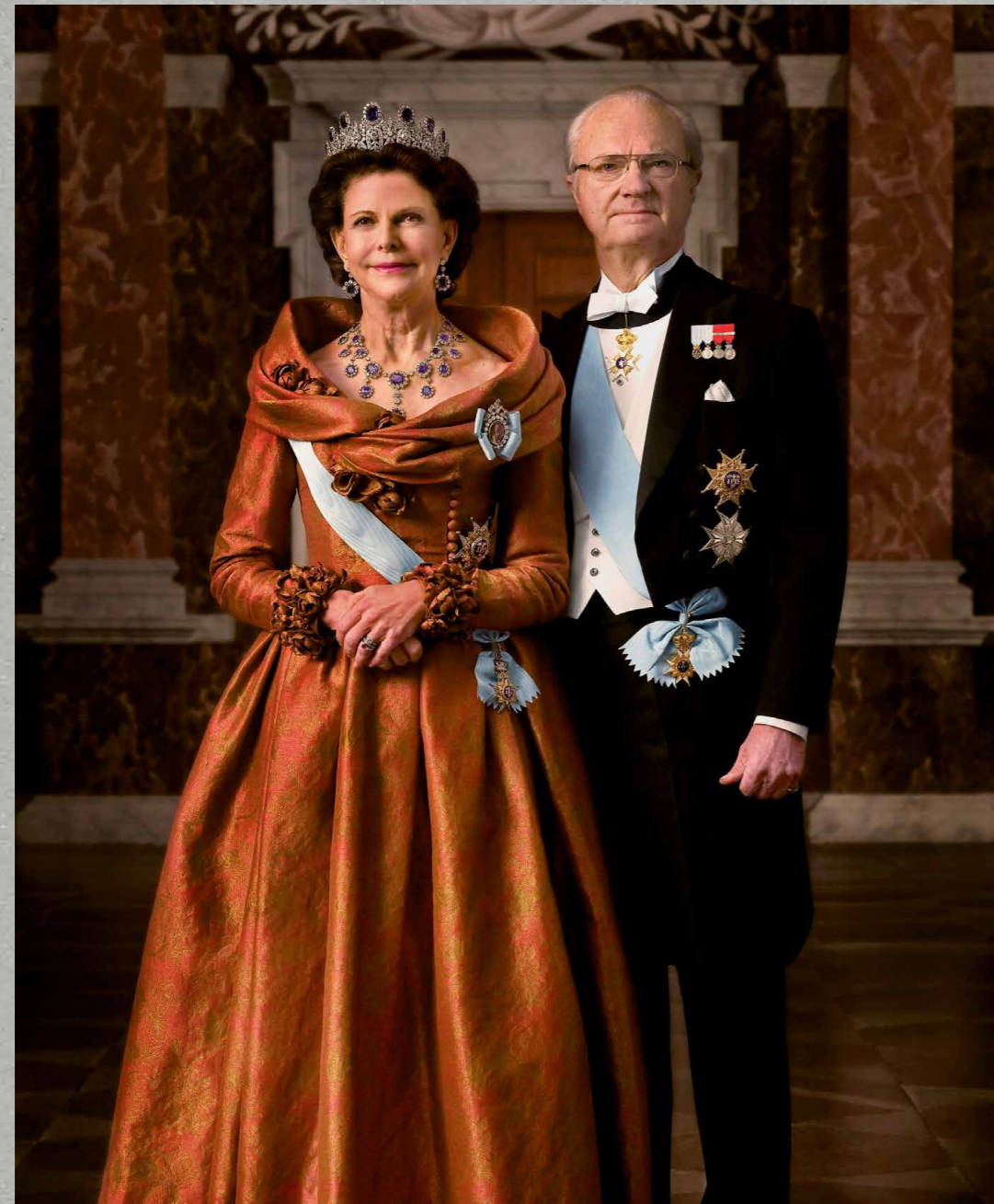
H.M. Queen Silvia and H.M. King Carl XVI Gustaf.