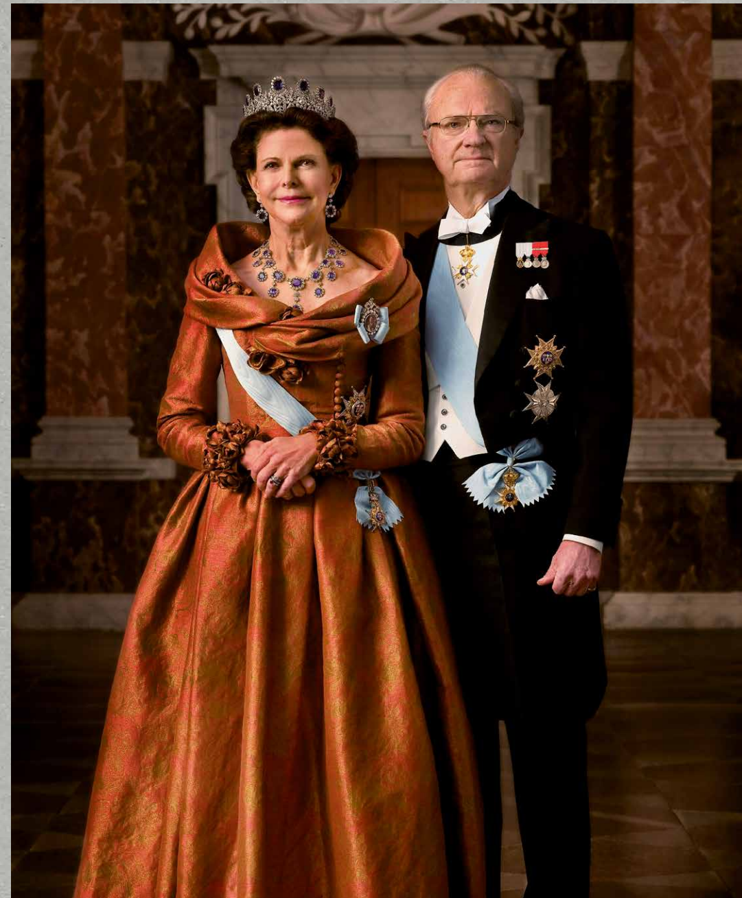
H.M. Queen Silvia and H.M. King Carl XVI Gustaf.